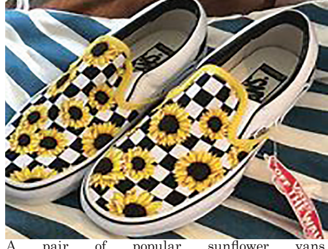
In with the Trends

make it work and have fun along the way.